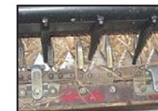
Same equipment treated with Rustop