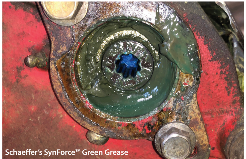
Schaeffer's SynForce™ Green Grease